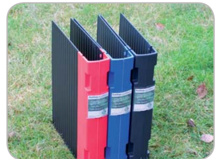
Up to 95% recycled material