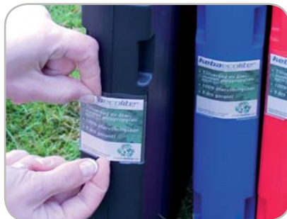
Easy to change label, even when the binder is closed