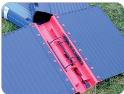
Patented reliable mechanism