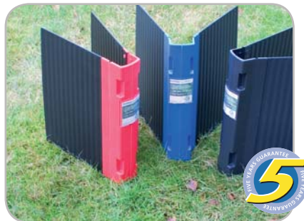
100% Plastic, light and strong